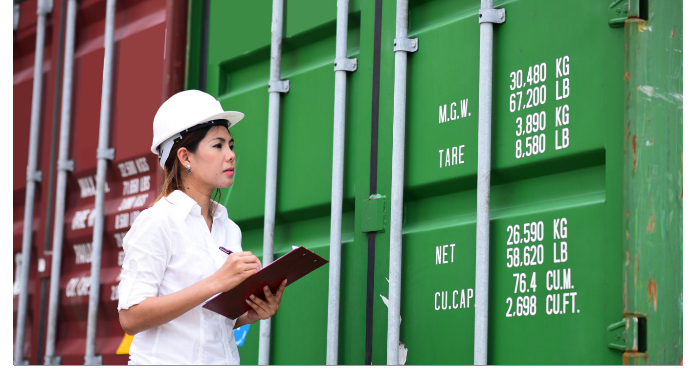
Dock worker in Bangkok, Thailand